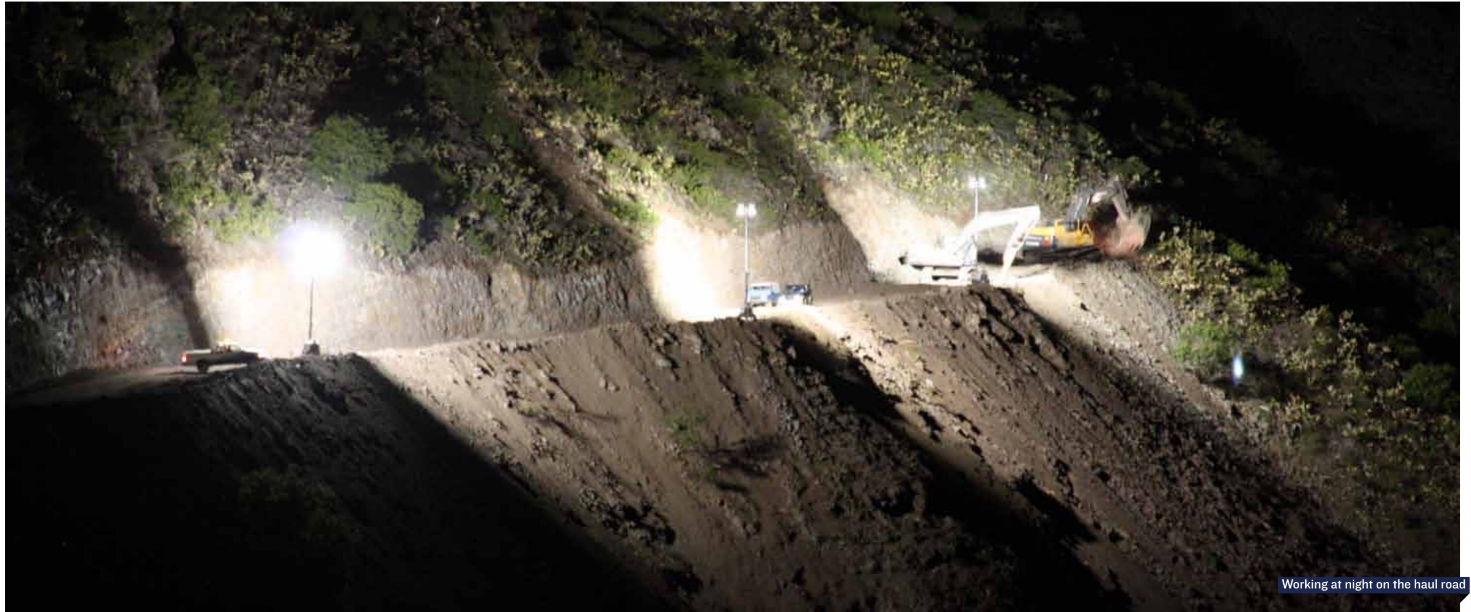
Working at night on the haul road

two months of 2014 exceed R10 billion, of which R1 billion has been awarded. The first project awarded to Basil Read Civils by Eskom is a contract for further work to be carried out at the Medupi Power Station Project. The contract to be executed over twenty months is for Phases I and II of the excess coal stock yard. The project comprises 965,000 cubic metres of bulk earthworks, 437,000 cubic metres of layer works, 1.1 million square metres of geosynthetic installation and will require 23,000 tonnes of bentonite.