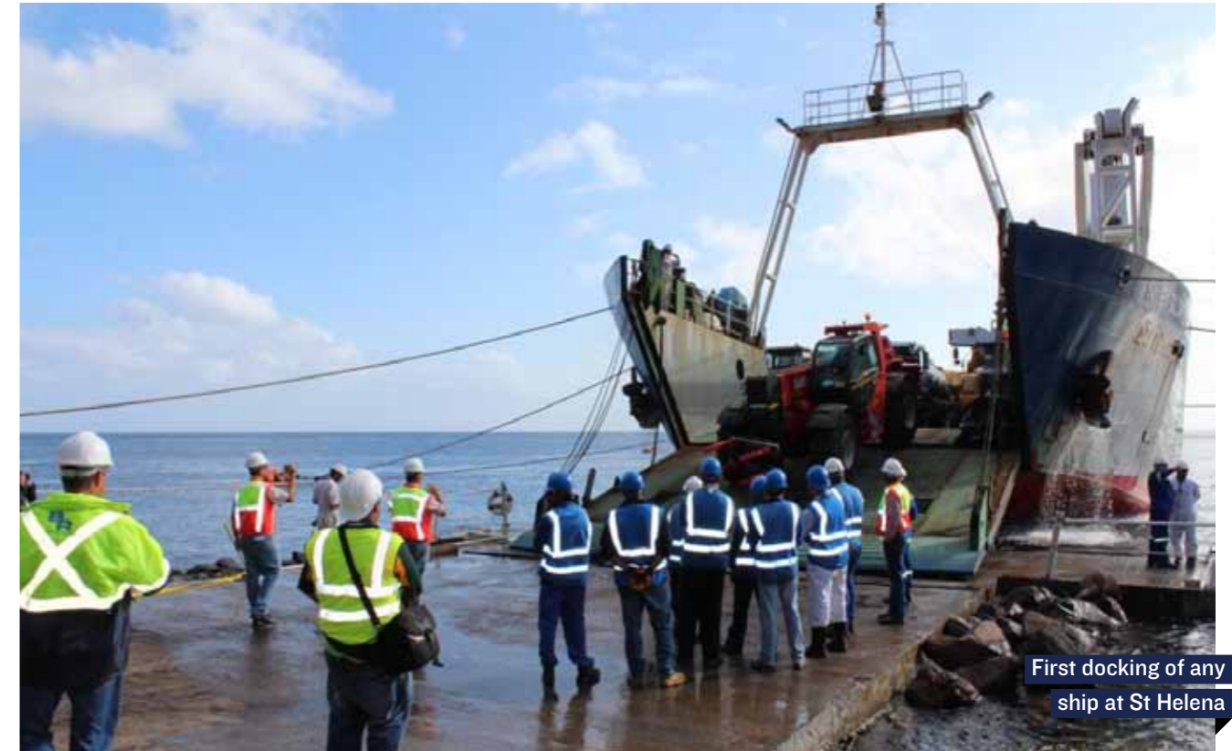
First docking of any ship at St Helena

across the continent, the division is exploring a range of opportunities across the continent.