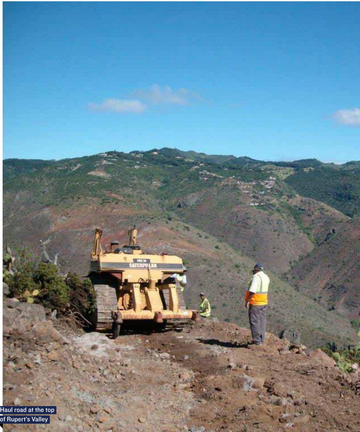
Haul road at the top of Rupert's Valley

“Notwithstanding the ongoing success of its St Helena airport project, Basil Read is about a lot more than just a single project”