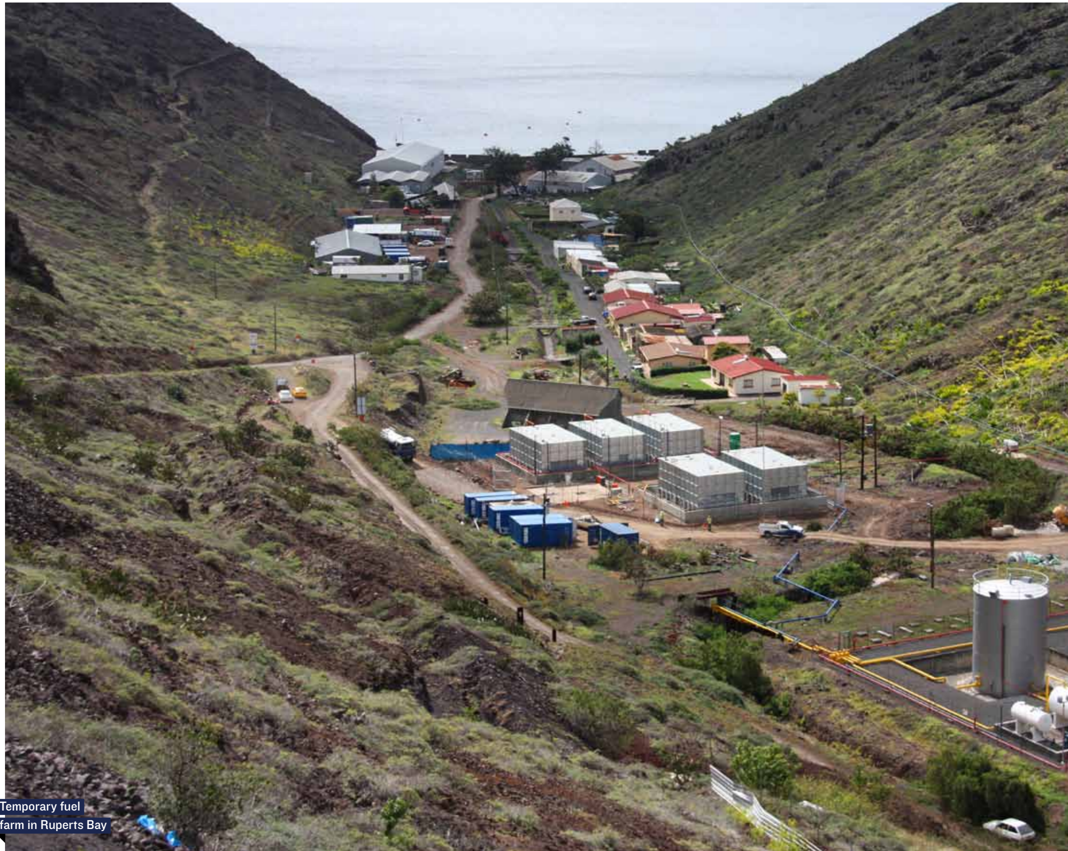
Temporary fuel farm in Ruperts Bay

When we last featured Basil Read within this magazine in October 2012, much of our focus was on the group's ongoing work on the St Helena airport project. Said article went into great depth regarding the efforts of the group to deliver the British Overseas Territory with its own international airport, and it soon became clear, to this writer at least, that this project would not only go on to be hugely significant for St Helena but for a group that was already able to boast an impressive track record.