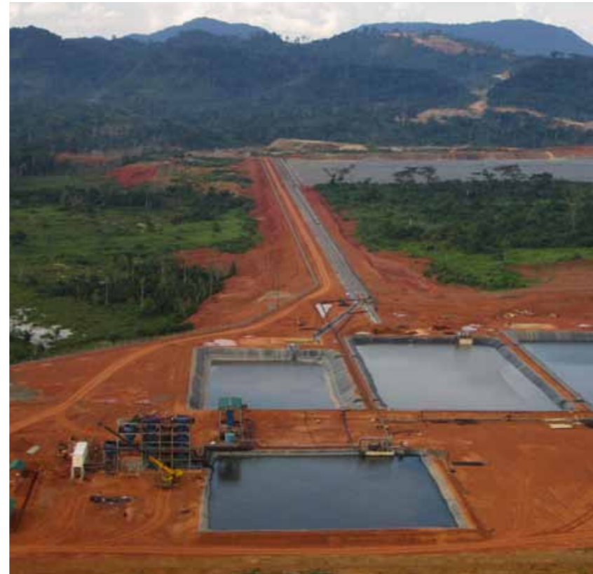
Heap leach ponds and pad