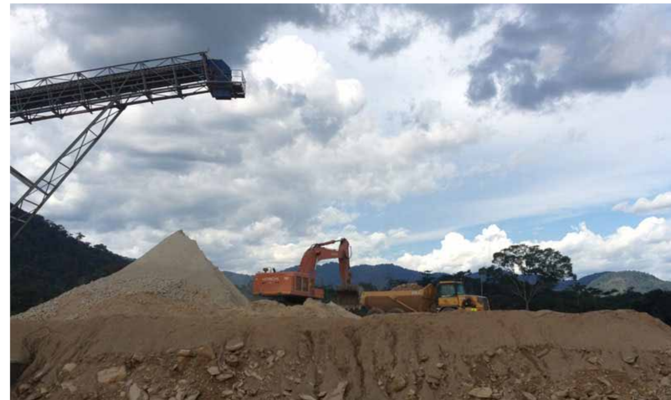
Re-handling of crushed ore from the primary product stockpile to the heap leach pad

Bukavu, successfully began gold production with the pouring of the first 320 ounces on December 30, making it Banro's second gold mine to come into production in just over two years. Construction began at Namoya in the fourth quarter of 2012. Remaining building work will continue in step with commissioning operations in the first quarter of this year, while commercial production is expected to be achieved before the end of June 2014. At full capacity, gold from the Namoya mine is expected to double the company's projected gold production to a rate of between 225,000 and 240,000 ounces a year.