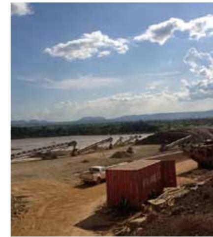
Stacking the heap leach pad

The story started in 1996 when Banro acquired control of the Twangiza property, and during the following year, undertook a $9 million exploration program which included 10,490 line-kilometres of airborne geophysics, 1,613 samples from 16 adits, and 8,577 drill core samples from 9,122 metres of core drilling along 800 metres