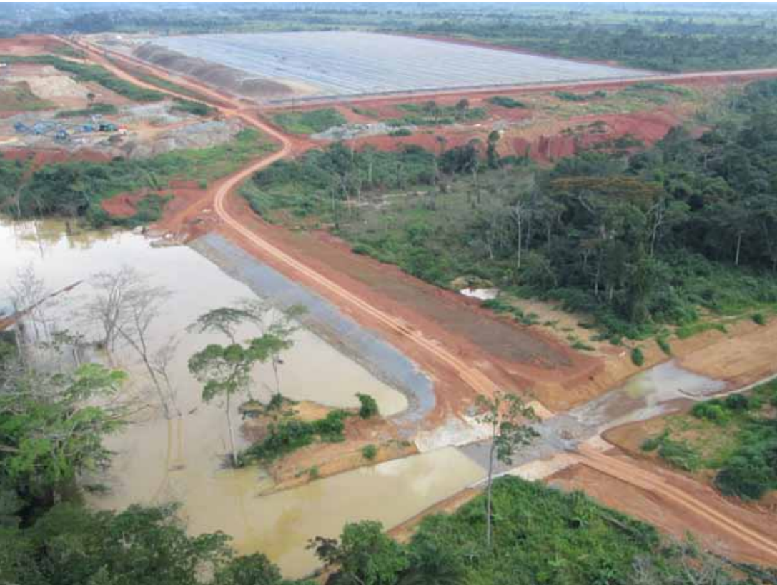
Plant make-up water dam and the heap leach pad