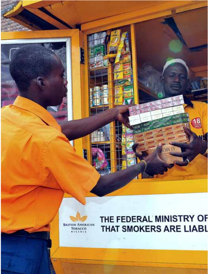
Distributor supplying goods to a retailer

We at Domestications are interior decorators. We specialise in turning the four walls of a house into stunning comfortable homes and your dull offices into attractive work spaces. Our services range from window covering to supply of furnishing requirements for every room in the house and office. Our services are turnkey, to ensure your stay is stress-free and memorable. Domestications: the ultimate in interior decoration. otoola2000@yahoo.co.uk