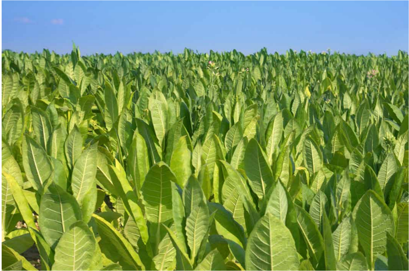
BAT is the only international tobacco group with a significant interest in tobacco leaf growing

. Advertising Support Services . Silk Screen Process / Digital Printers