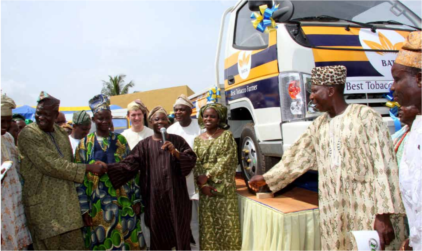
Oyo state governor's visit to Ibadan factory

Address: 19 Adekunle Fajuyi Crescent, Off Olutoye Crescent, off Adeniyi Jones Avenue, Ikeja. E-mail: info@batescasse.com www.batescasse.com