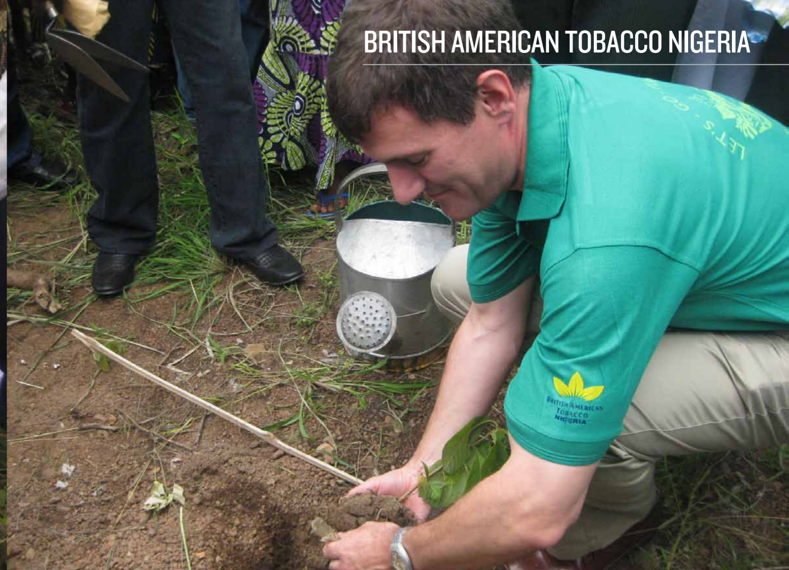
Tree planting campaign, Jabata, Oyo State