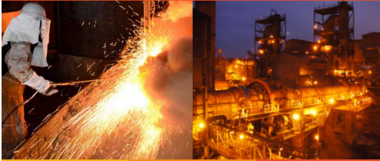
PLATE • HOT ROLLED COIL • STRUCTURAL SECTIONS • RAIL • BILLETS • SLABS