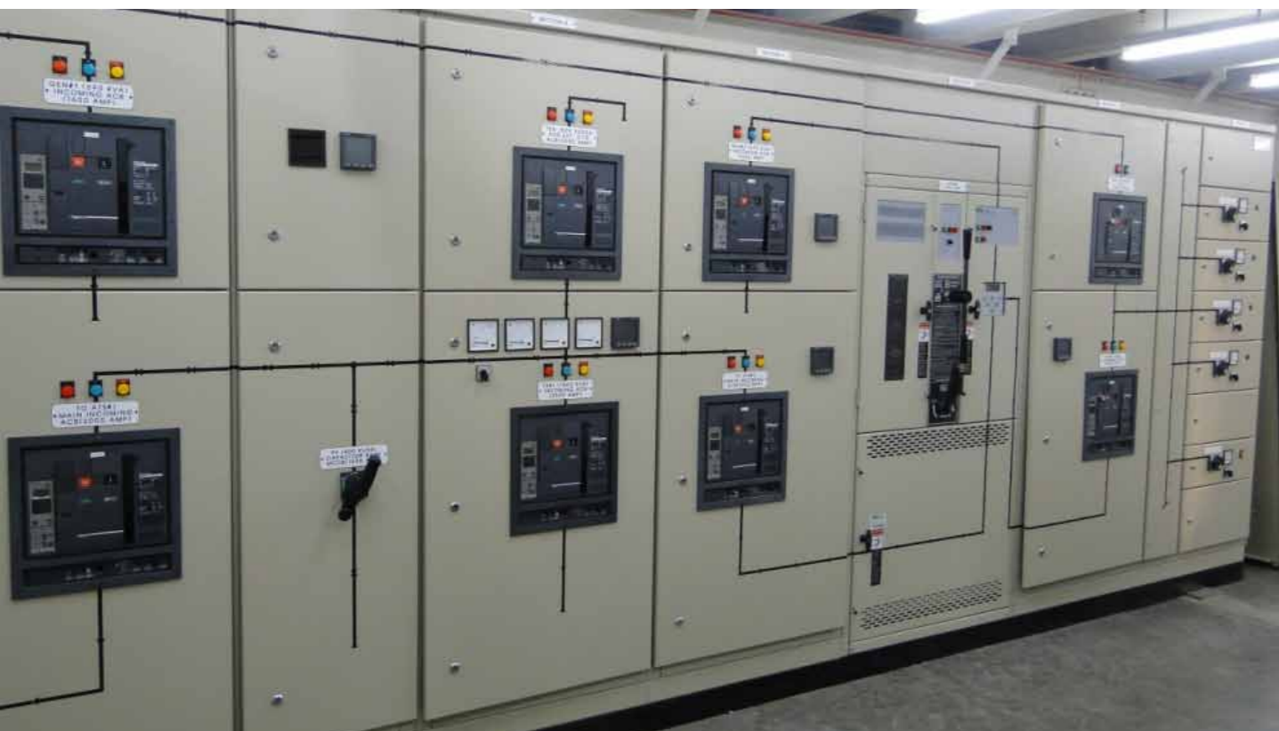
Substation control panel with automatic transfer switch

“WE PUT A GREAT DEAL OF TIME, EFFORT AND QUALITY INTO THE SOLUTIONS WE PROVIDE”