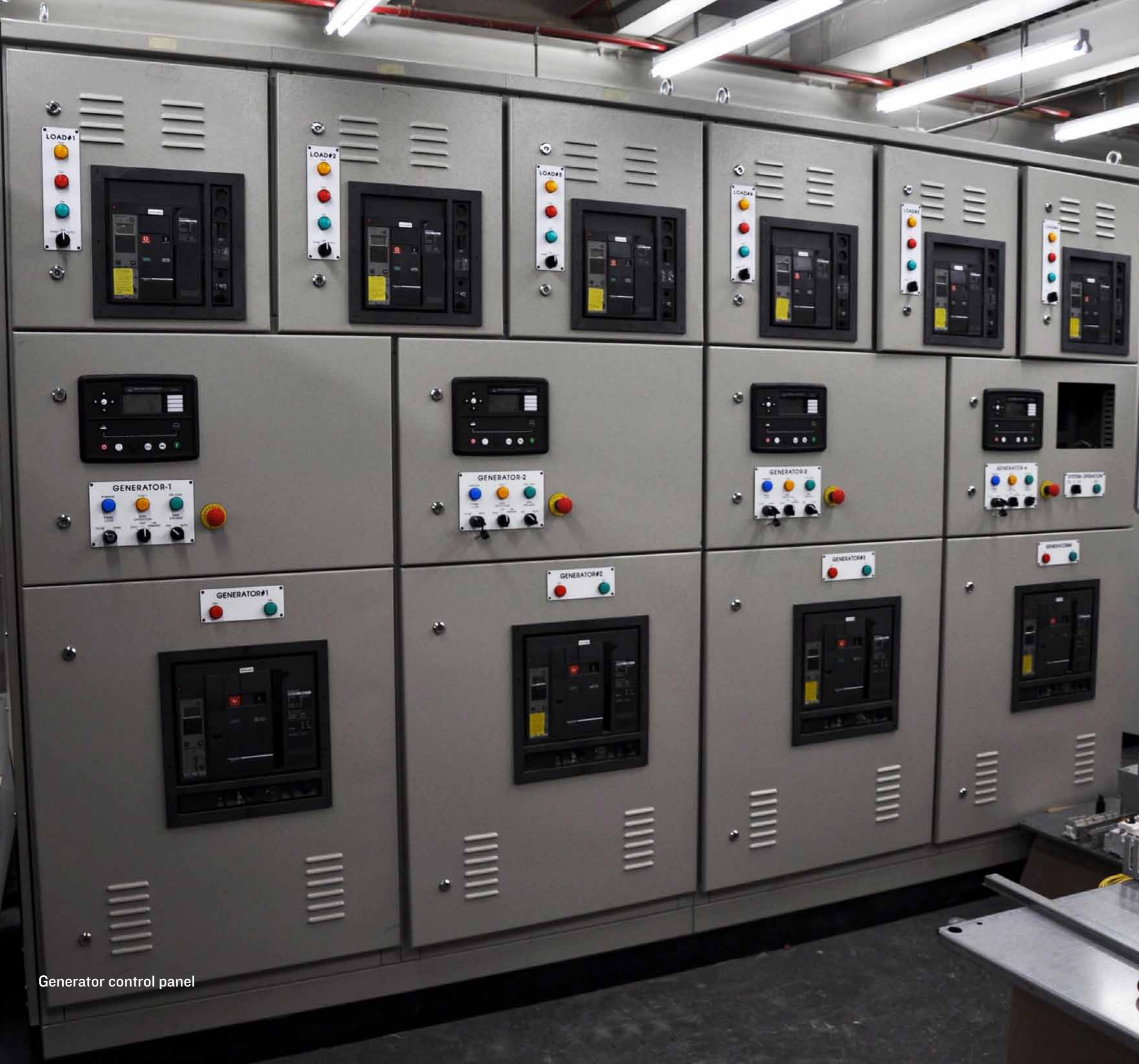
Generator control panel

From the very beginning, the company's expertise lay in understanding industrial processes in their entirety, and designing complete and highly specified automation and control solutions for repair and renovation as well as new installations. Now,