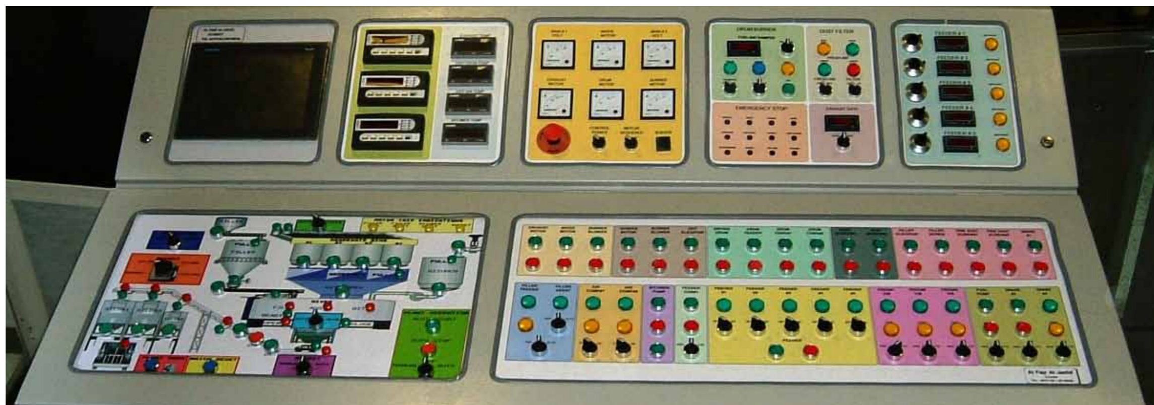
Batching plant control desk

A more recent success story has been the introduction of mobile synchronising systems for the oil industry. Oil wells in Kuwait are often in remote locations, so each pump is powered by its own electrical