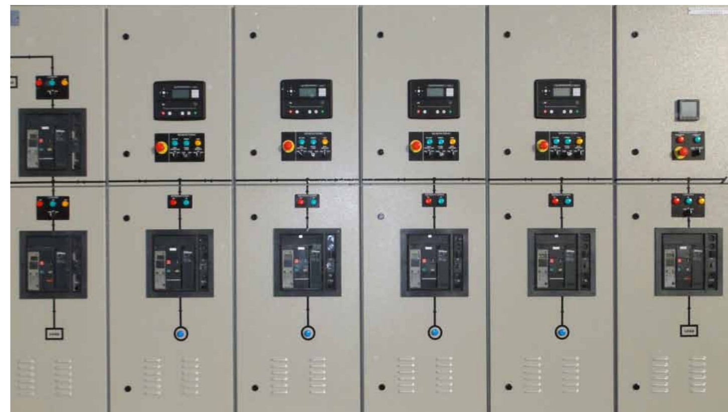
Generator sync panel