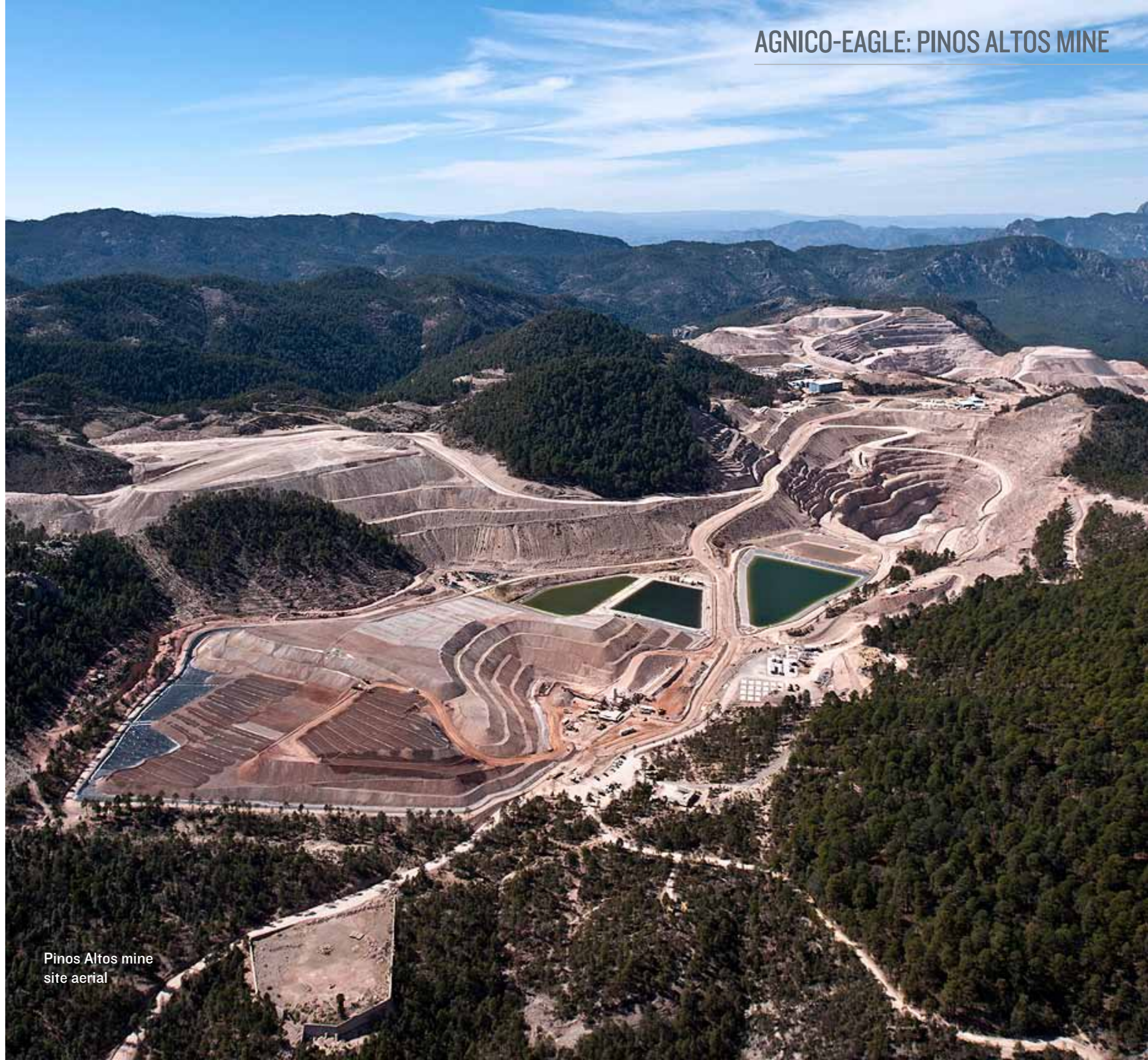
Pinos Altos mine site aerial

Pinos Altos is expected to produce 159,000 ounces of gold as well as by-product silver in 2013, and to average 148,000 ounces of gold per year from 2014 to 2015, with a mine life through 2029. In addition, Creston Mascota is expected to pour 32,000 ounces of gold in 2013 and to average 54,000