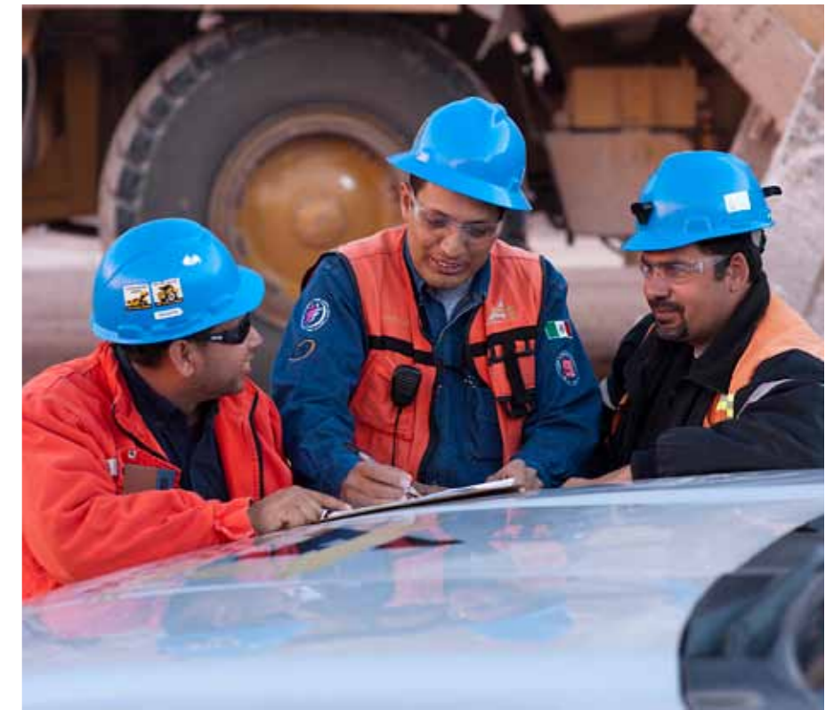
Pinos Altos employees

In the third quarter of 2013, payable gold production from the Pinos Altos mill and heap leach pad totalled 43,736 ounces, at a total cash cost per ounce of $404. Additionally, silver production totalled 614,000 ounces in the quarter. The quarter saw Pinos Altos process some 661,000 tonnes of ore, with the