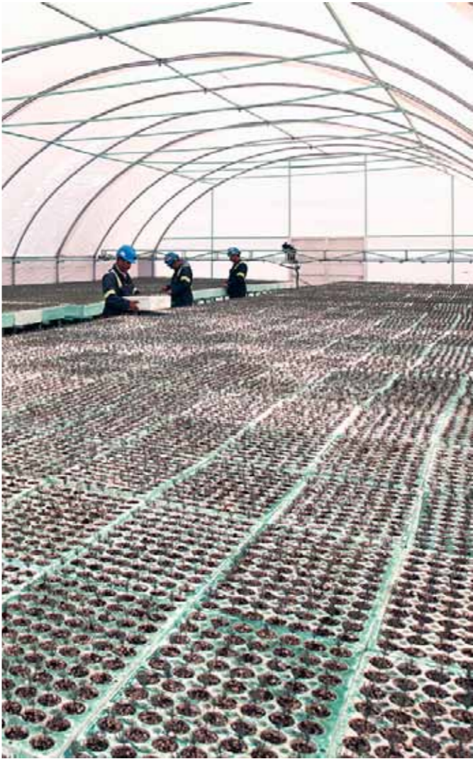
Pinos Altos tree nursery