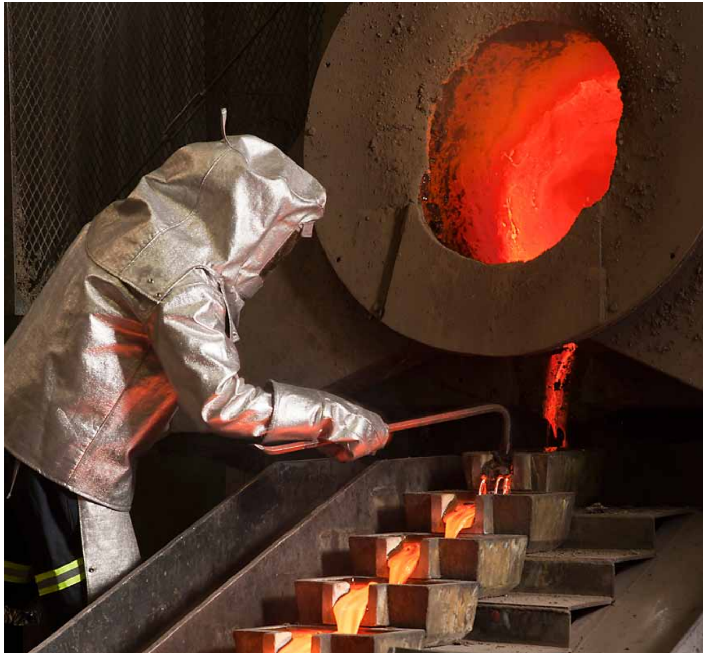
Pinos Altos gold pour

“PINOS ALTOS IS EXPECTED TO PRODUCE 159,000 OUNCES OF GOLD AS WELL AS BY-PRODUCT SILVER IN 2013”